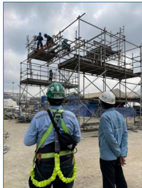
“Scaffolding Installation Supervisors and Inspectors Training” course