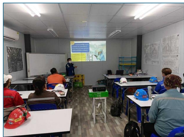
Safety and occupational health training for new workers within the construction unit