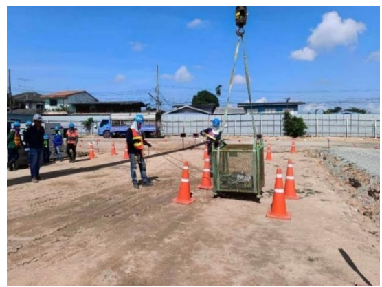
“Crane Operator, Signal man, Rigger and Lifting Supervisor Training” Course