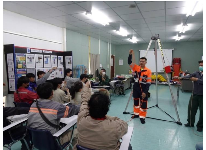
“Safety in Confined Space Work Training” Course