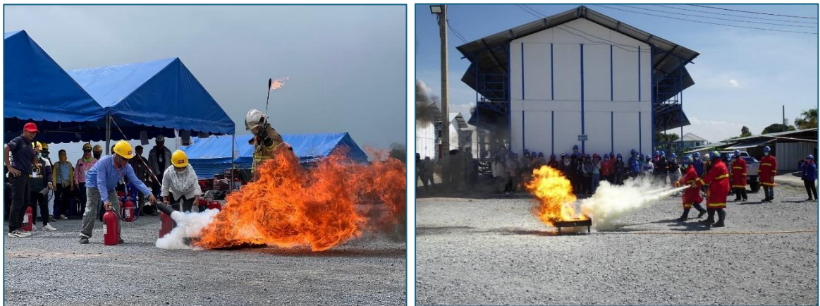
Fire Drill and Emergency Evacuation Training

The company places great importance on the Ministerial Regulation on Safety, Occupational Health, and Working Environment Management Standards for Fire Prevention and Suppression B.E. 2555 (2012). It has developed a fire prevention and suppression plan and conducts basic fire extinguishing training as well as annual fire evacuation drills at all construction sites, including both work areas and employee residential areas.