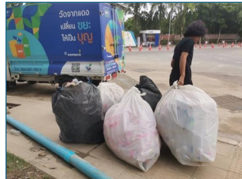
The “Change Waste into Merit” plastic bottle donation activity at the Government Complex”