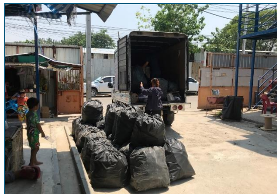
The “Change Waste into Merit” plastic bottle donation activity at Mochit Complex”