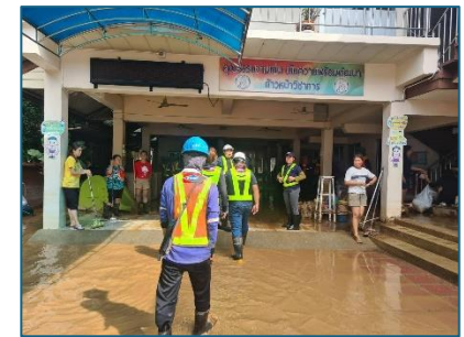
“Restore the Brightness to Chiang Rai”