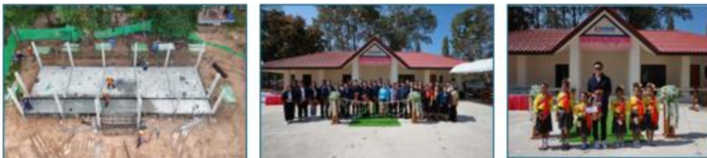
“Chanweerakun Building 72,” Udon Thani Province