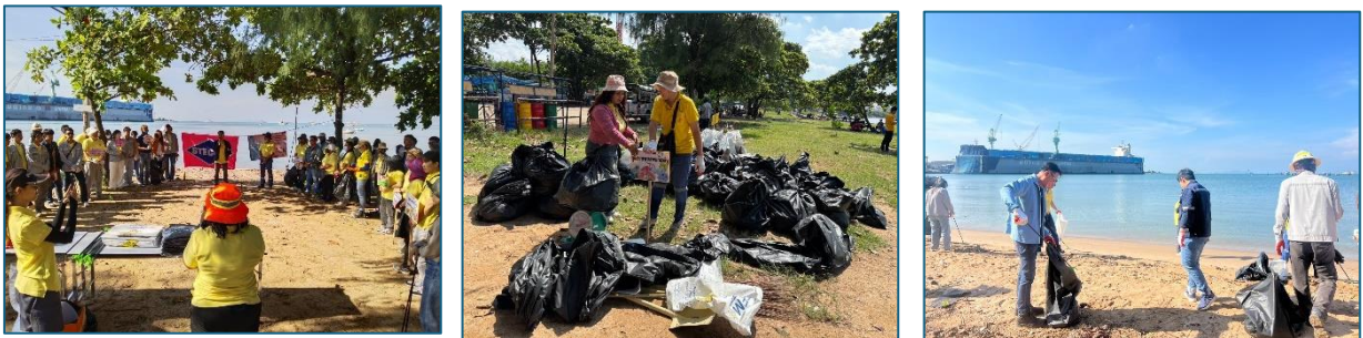
“Collecting Trash along the Ban Laem Chabang Beach”

The activity of collecting trash along the Ban Laem Chabang Beach in Chonburi was organized by the Clean Energy Thai Oil Construction Project team to promote social and environmental responsibility among employees. The goal was to reduce marine waste, which is a source of pollution that disrupts natural balance. The initiative also focused on effective waste management, separating waste into different categories. For example, plastic waste was processed for recycling, organic waste was composted in designated areas, and hazardous waste was sorted and disposed of according to hazardous waste management standards.