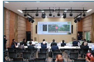
The 2 nd “Construction Innovation Challenge” Project