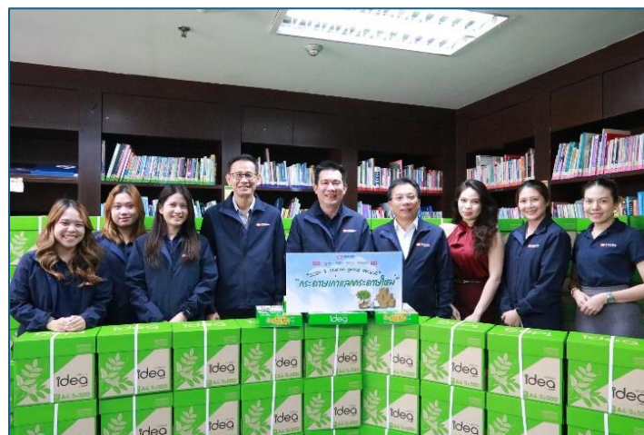
The “Old Paper Exchange for New Paper” Project

Currently, 86 boxes of A4 paper have been exchanged.