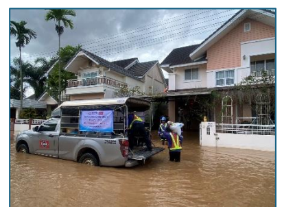
“Sino-Thai with Heart for Society”