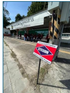
“Maintenance Activity for the Public Transport Shelters in the Community”