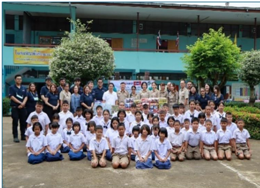
“Donating Hot and Cold Water Dispensers”