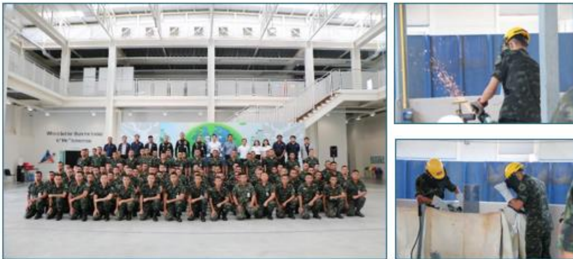
Short-term vocational training activity for active-duty soldiers preparing to be discharged