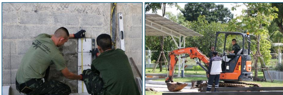
Vocational training activity for conscript soldiers preparing for discharge